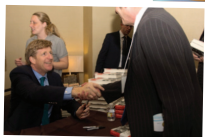
Congressman Patrick Kennedy greets guests